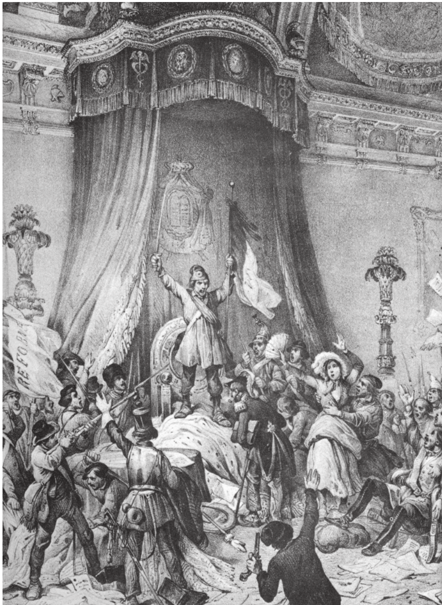
A drawing from the time of the throne room in the Tuileries, Louis Philippe's palace, 24 February 1848.