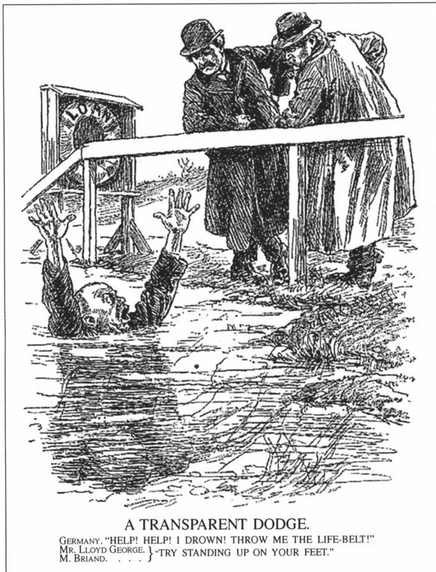
A cartoon from a British magazine, 1921. It shows Germany kneeling in the water. Lloyd George and Briand (the French Prime Minister) are on the right.